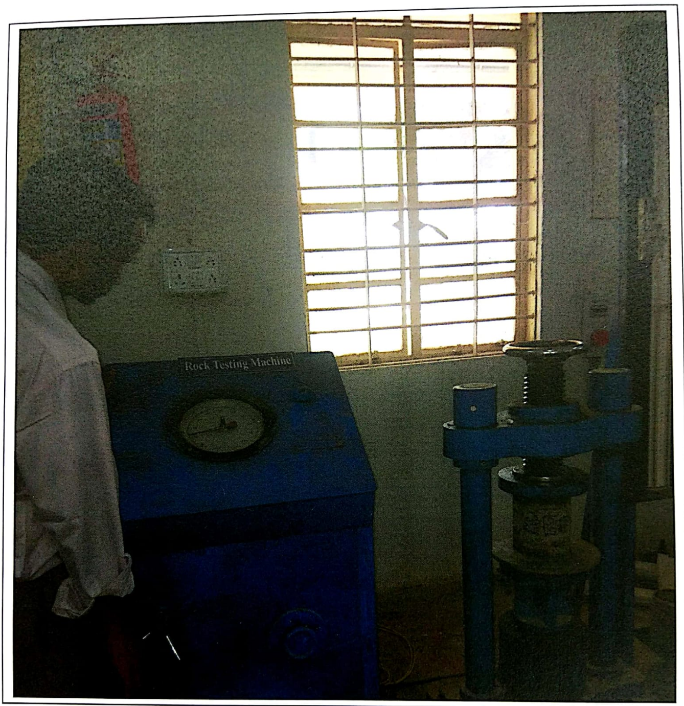
Figure 1: Compressive strength testing of the stabilized core specimen